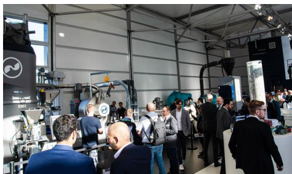
The daily live recycling demonstrations and the exhibition with around 70 products made from recyclate attracted huge numbers of visitors to the EREMA Circonomic Centre at this year's K.

It was not only the EREMA Group's trade fair stand that attracted visitors; the EREMA Circonomic Centre in the outdoor area also proved to be extremely popular. Twice a day, a total of twelve plastics streams of different degrees of contamination and bulk density were recycled live using an INTAREMA® TVEplus® machine. These live demonstrations, as well as the exhibition of around 70 products made from recyclate, were very well attended. The aim of the recycling machine manufacturer in the Circonomic Centre, together with many well-known brand partners from the value chain, was to draw attention to what is technologically possible in terms of recycling and the Circular Economy, and in many cases has already been successfully implemented in commercial terms. That is because plastics with one hundred percent recycled pellet content can now be found in children's toys as well as in food packaging. "This really opened the eyes of many visitors, and will help us implement new circular economy projects even more quickly in future," says Manfred Hackl.